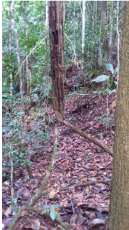
silviculture treatment on the ground at Mt.Wullersdorf FR and Ulu Kalumpang FR