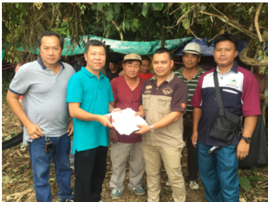
Site handover to the Sentiasa Maju Contractor & Disamodra Enterprise