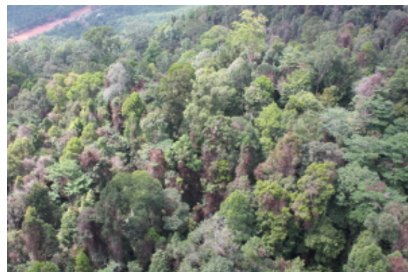
View from the air silviculture treatment at Mt.Wullersdorf FR and Ulu Kalumpang FR